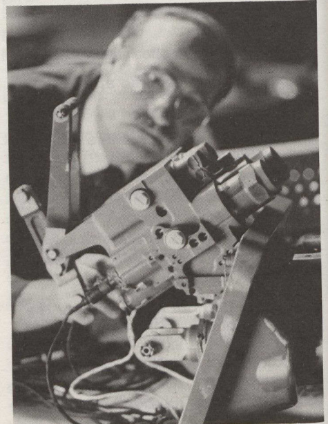
Menasco will apply the latest technology to the design of the horizontal stabilizer for the Fokker F28 above, in the development of one for the Netherlands' Fokker 100.

Pointing out that it is best for the Canadian aerospace industry if the barriers to international trade were eliminated, the minister for international trade said that