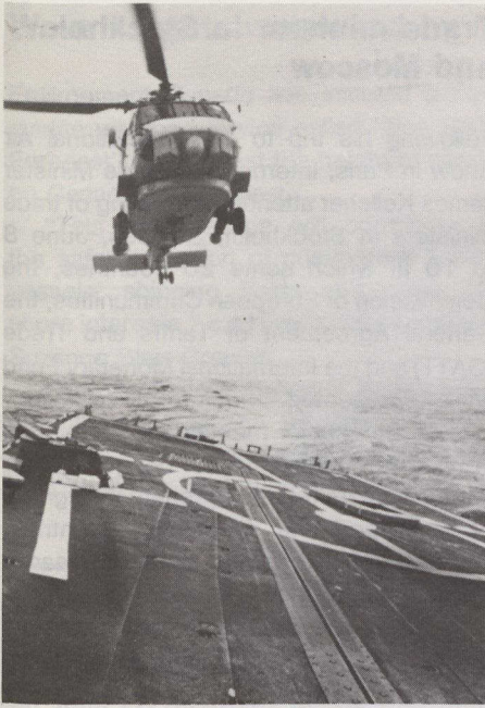
The US Navy signed a contract to purchase DAF Indal's RAST systems that help helicopters land safely on ships at sea.

In addition to foreign sales at the Paris Air Show, a number of contracts with the Canadian government were signed. Leigh Instruments Limited of Ottawa, Ontario, signed a $30-million order to supply 40 tactical air navigation systems to the government and Litton Systems Canada Limited of Toronto signed an order worth $1.6 million for inertial navigation systems for the Defence Department's new Challenger aircraft.