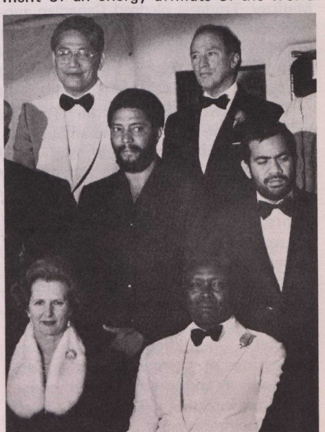
Prime Minister Pierre Trudeau (top right) stands with other Commonwealth Heads of Government following a dinner with Queen Elizabeth aboard the Britannia.

With regards to the Cancun conference, Mr. Trudeau said before the Commonwealth Heads of Government meeting that he thought the talks in Melbourne would be profitable if the participants could reach agreement on the establishment of an energy affiliate of the World