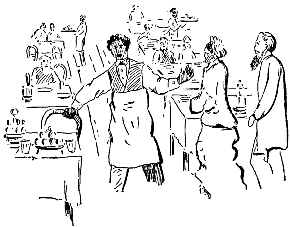
TEMPLE CAFE'. (See page 28, last issue.)

T is easy to find one's way about in Washington. Our hotel was close to the corner of F and Ninth streets. The streets that ran parallel were named F, G, H, I, etc., one way, and those crossing them at right angles were 9th, 10th, 11th, 12th streets, etc.