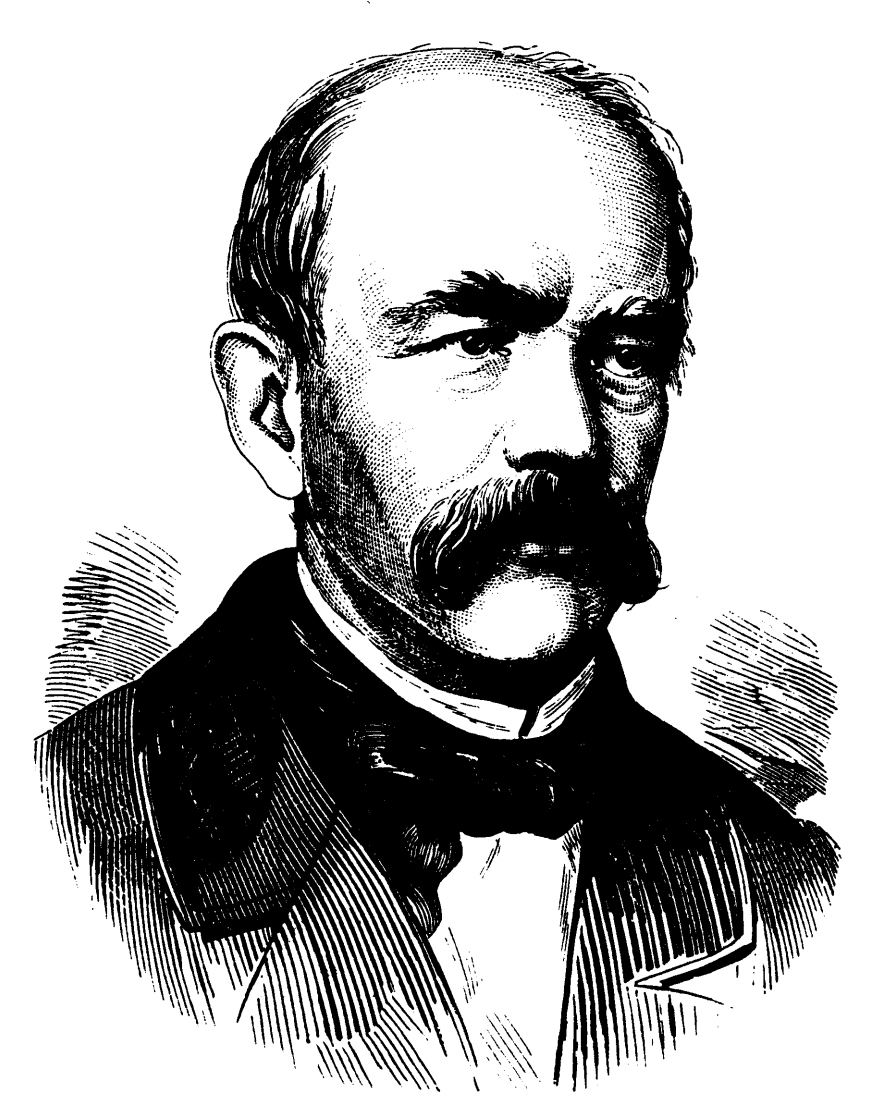
COUNT VON BISMARCK.