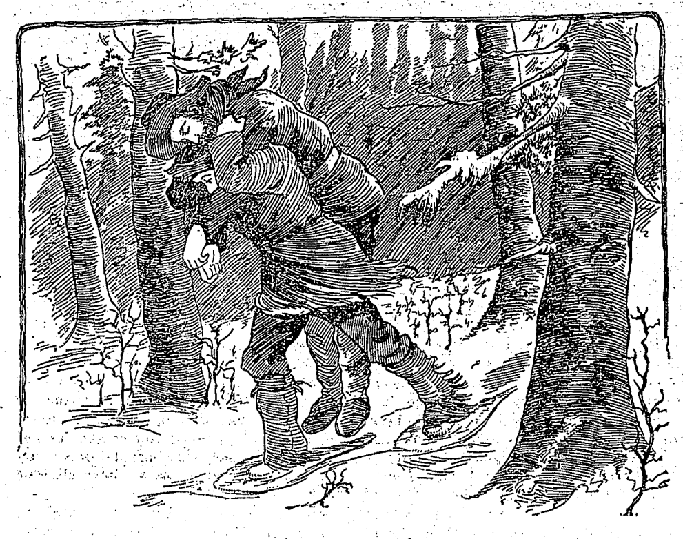
THE INDIAN LAD FOUND HIS BURDEN VERY HEAVY.