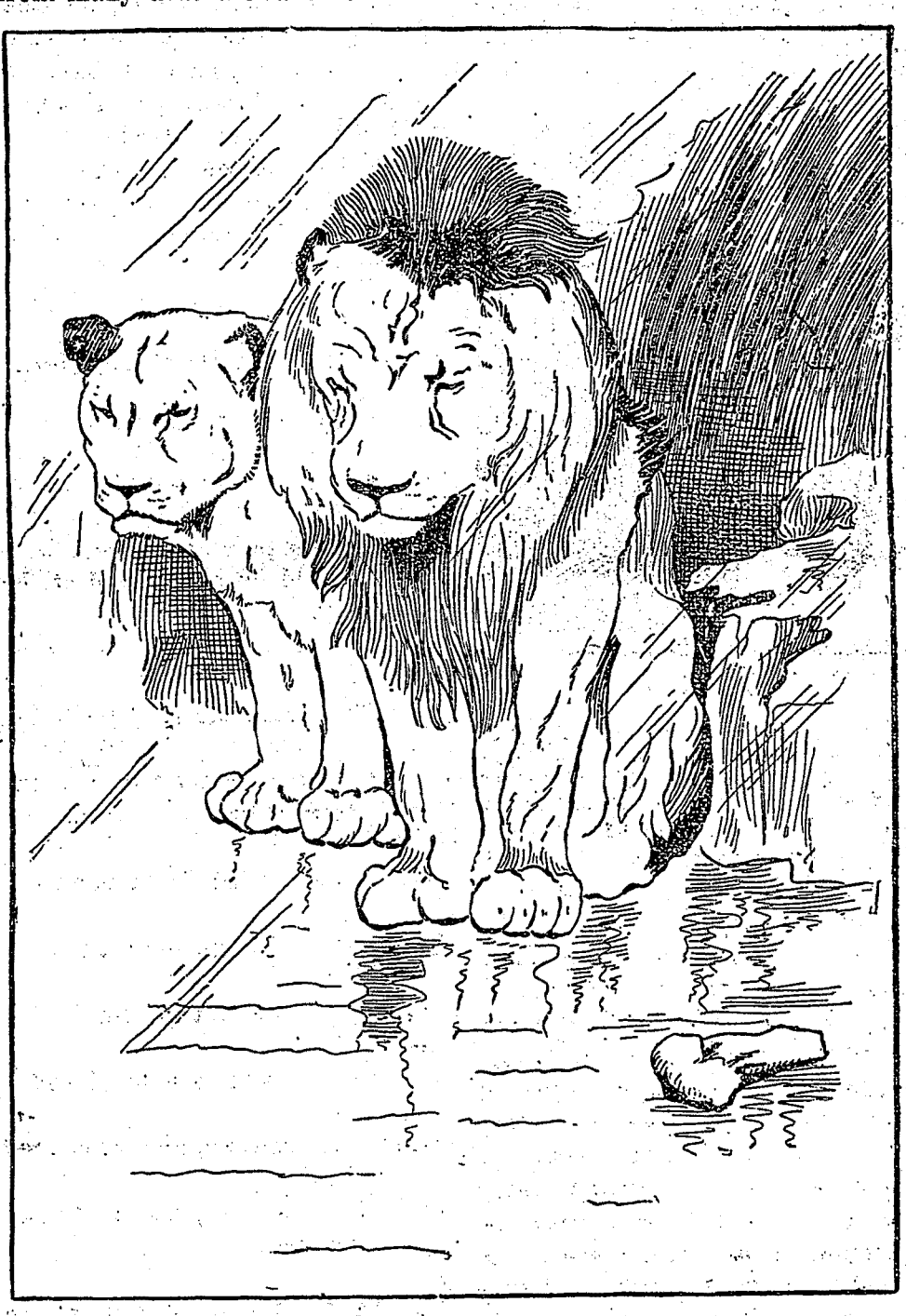
A WET DAY AT THE ZOO.

Gardens to be taken care of by the keepers; so that you see there are many ways of getting the creatures for the Gardens. There is a great variety of animals, too: some are quite small and some very large, like the elephant, the biggest animal in the world, and yet so quiet and gentle that he walks about the garden paths all day, giving the boys and girls rides on his back, and holding out his trunk for buns and biscuits as he goes along. Some animals, too, come from hot coun-