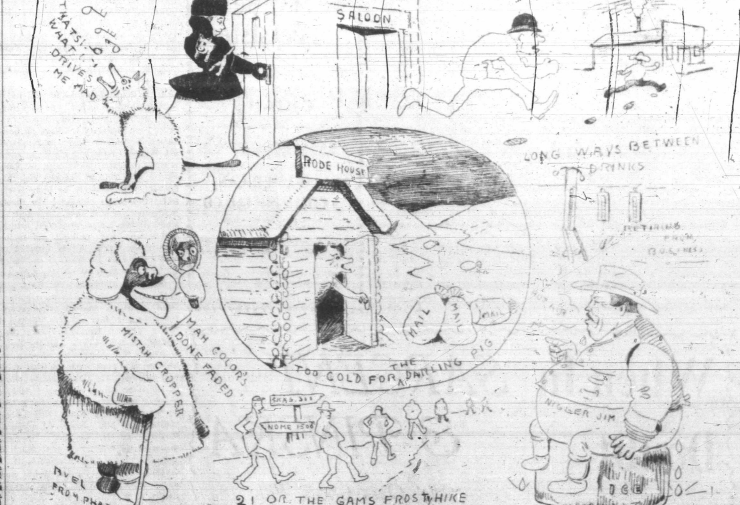
SOME COLD WEATHER SUGGESTIONS.