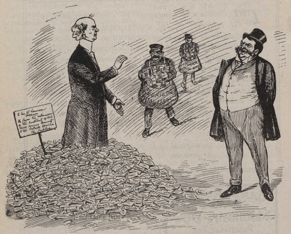
The Rising Tide of Post Cards.

The Canadian Courier remarks à propos of the cartoon below:— "Our post-card campaign for the extension of Civil Service Reform to the 'Outside Service' is progressing favourably. Six hundred post-cards have been received. Two thousand are desired. Have you sent one?"