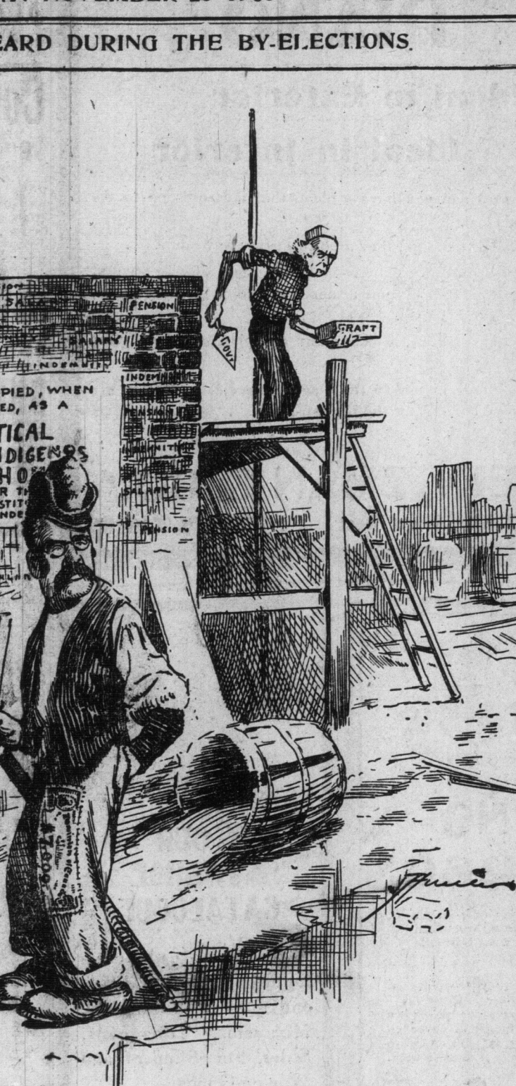
The Man with the Hod—They do be tellin' me their throuble, wid the boss havin' no buildin' permit.

MUTINY IN BLACK SEA FLEET AND SEBASTOPOL GARRISON. London, Nov. 24.—A despatch to Reuters' Telegram Company from St. Petersburg says that there has been a mutiny in the Black Sea fleet and that portions of the Sebastopol garrison have mutinied, killing the chief of staff and wounding a colonel.