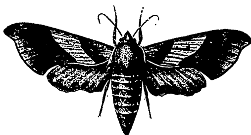
Colors olive green and grey.