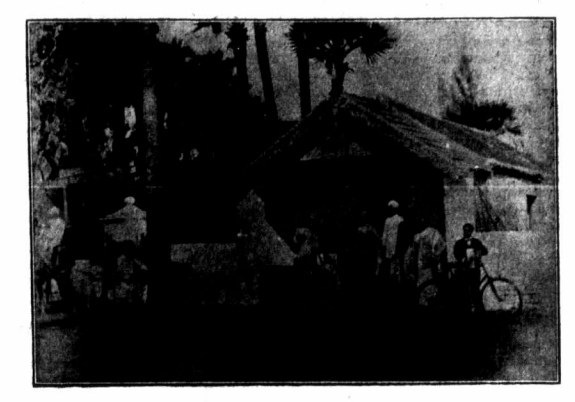
BAPTIST BOOK ROOM AT COCANADA