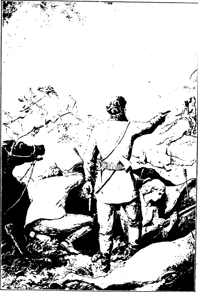
"AMMUNITION'S GETTIN' LOW," SAID DICK.—Page 304.