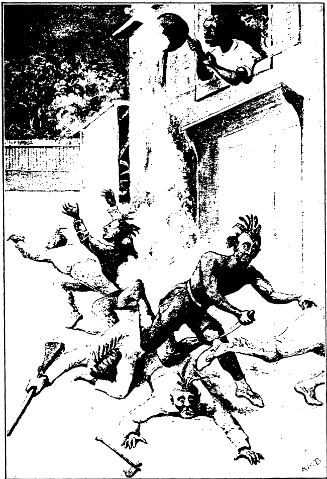
"NOW, BUTTERCUP, GIVE IT 'EM—HOT."—Page 217.