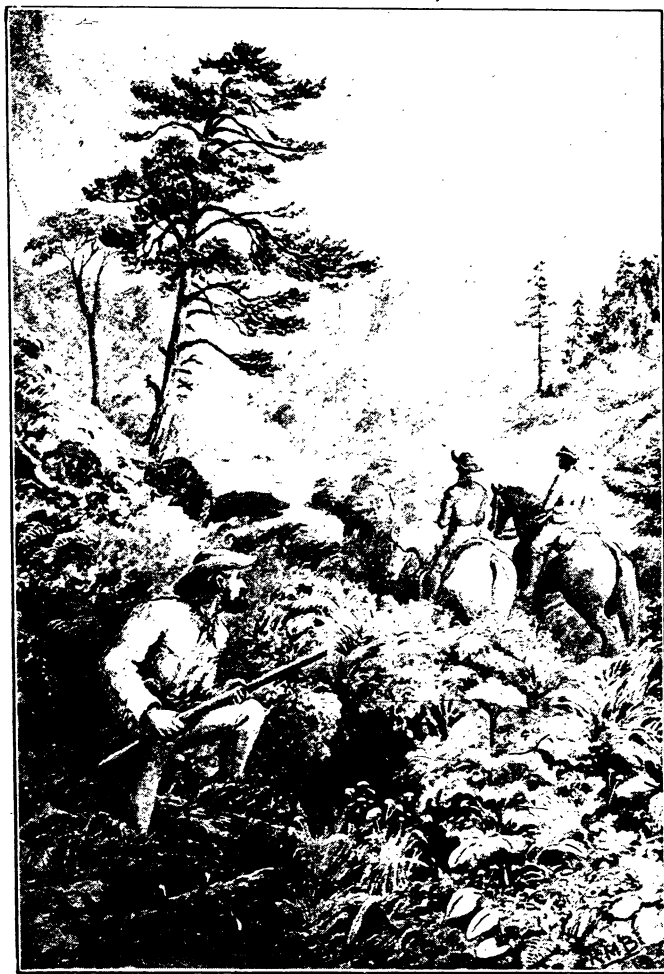
"HE WATCHED THE ROBBER AND HIS VICTIM RIDE QUIETLY AWAY."—Page 162. [ Frontispiece. ]