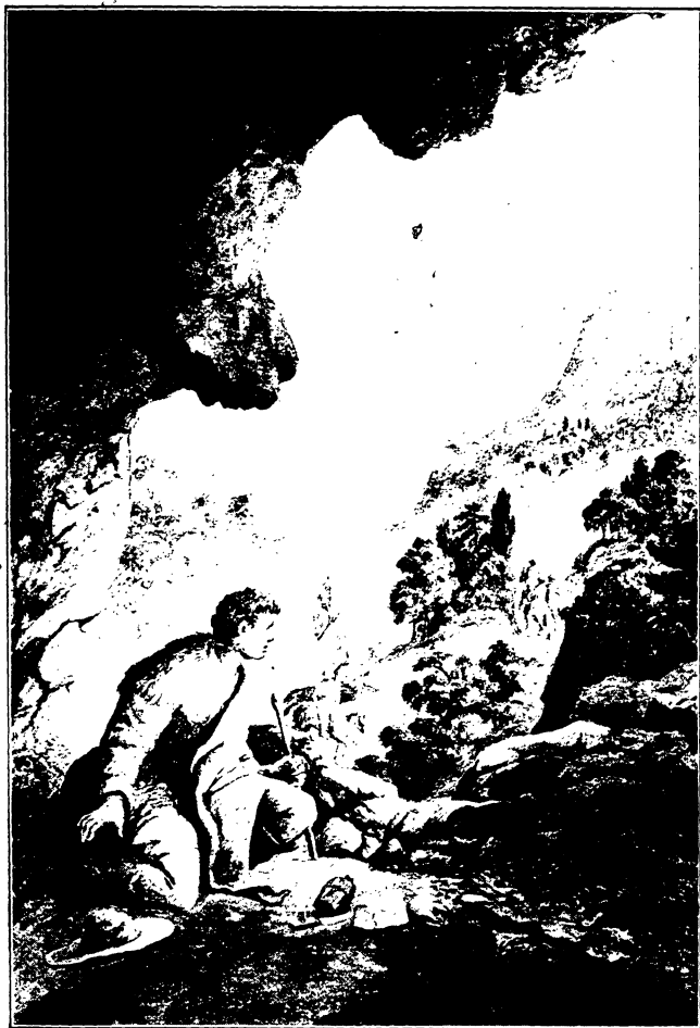
"AND RAN TO THE OPENING, WHERE HE SAW THE TROOPERS STILL RIDING ABOUT."—Page 272.