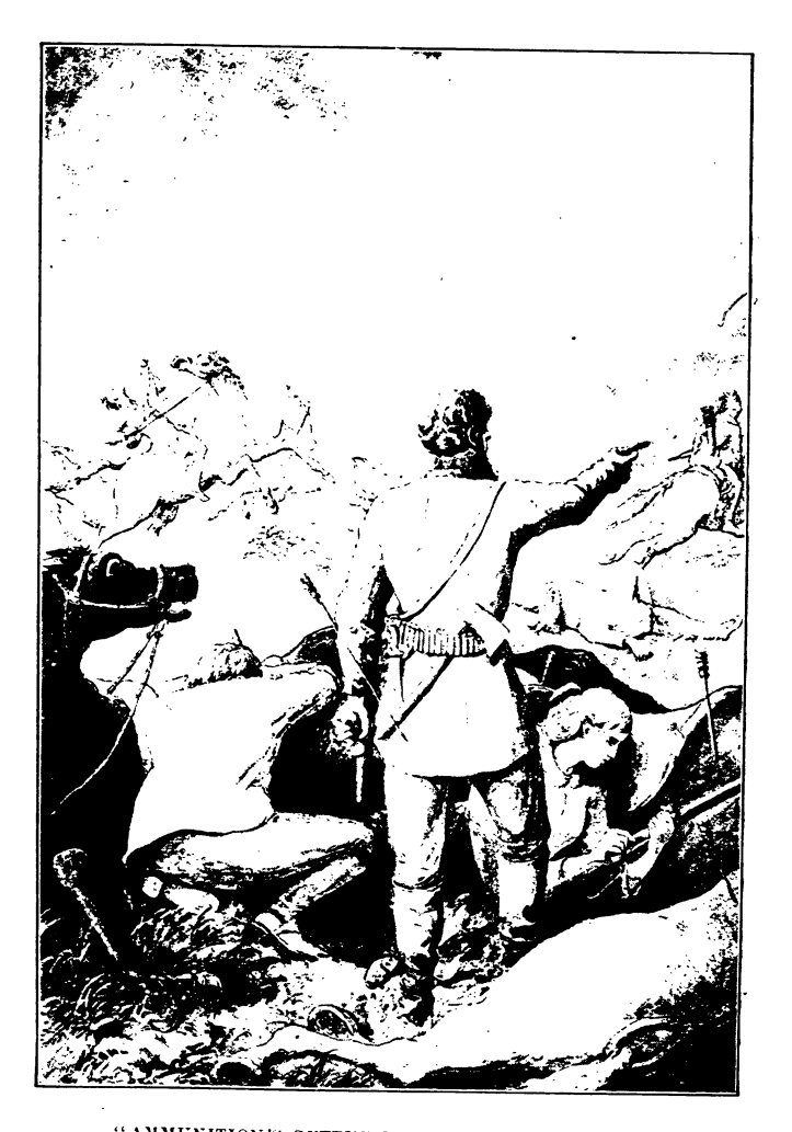
"AMMUNITION'S GETTIN' LOW," SAID DICK .- Page :04.