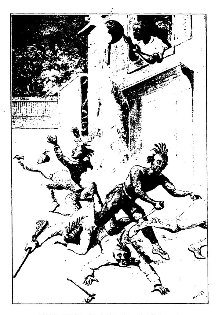
"NOW, BUTTERCUP, GIVE IT 'EM-HOT."-Page 217.