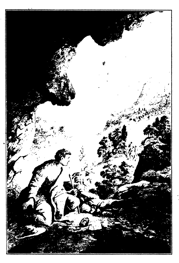
"AND RAN TO THE OPENING, WHERE HE SAW THE TROOPERS STILL RIDING ABOUT."—Page 272.