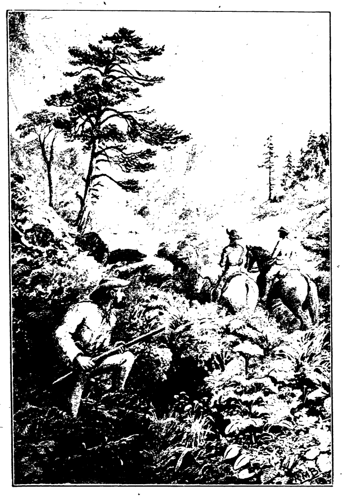
"HE WATCHED THE ROBBER AND HIS VICTIM RIDE QUIETLY AWAY."—Page 162. [Frontispiece:]