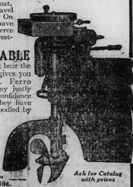
Ask for Catalog with prices

The results you get are due to a finished product. Try it yourself—today! L. M. TRASK & CO., Sole Distributors for Nfld., P. O. Box 1271, St. John's.