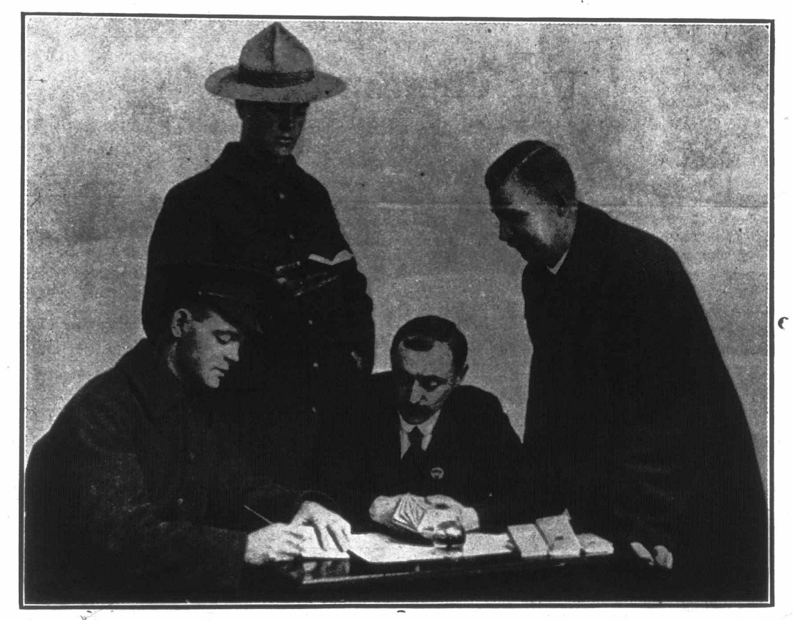
The Canadian Churchman.

"If it were possible to claim space in your paper for the unsolicited testimonies that reach our office of how lives have been redeemed, homes blessed, munities changed, through the introduction of the simple and sane method of Christian service of creating the habit of daily reading and carrying of the Word, it would make interesting reading. A sister of two of our Canadian hoys on Salisbury Plain writes thanking us for what the Pocket Testament League has meant to their home, how the brothers have been faithful to their pledge at home and in the camp. At first, writes the sister, they were laughed at for the stand which they took, and now things have changed in their favour, instead of ridicule the highest respect is shown them. During the past year of 1914, in Canada alone there has been an increase of 282 Local Branches and 36,046 members "