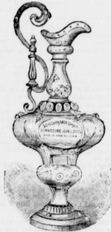
THE AMERICA CUP.

Underneath is a picture of the Queen's cup, raced for by the "Puritan" and "Genesta," and won by the former. It is an ugly enough piece of solid silver and has sentences engraved on all sides telling of the races in which it has been contested for.