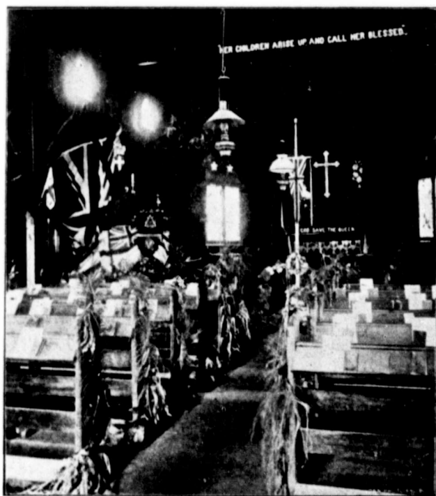
S. O. E. JUBILEE SERVICE ROUND THE WORLD—DECORATIONS IN THE ENGLISH CHURCH AT SUVA, THE CAPITAL OF THE FIJI ISLANDS.

Writing from this city, June 21, Mr. B. Cowderoy, local secretary of the Royal Colonial Institute, who has been most active in promoting the scheme in Australia says:—"Both Cathedrals (Anglican and Roman Catholic) were crushingly full, as a military parade had been ordered and all our local forces were in attendance with their military bands. In the Exhibition building several thousands, after addresses by leading (Wesleyan) ministers and laymen, took up the National Anthem at our standard time (4.20). In the largest of the Congregational churches about 600 children had been gathered from their Sunday schools, and several hundred adults took part in the great service of praise, and there, as in several other churches of the same denomination, large congregations contributed to the grand chorus at 4.20. At the principal metropolitan church of the Presbyterians there was not standing room by half-past 3 o'clock, and they also sang the anthem at