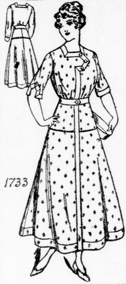
A SIMPLE GOWN FOR HOME OR PORCH WEAR.

1733—Ladies' Dress, With Sleeve in Either of Two Lengths. Dainty in white with pink dots, is here shown. This style for a morning dress would be nice in linen or seersucker, gingham or chambray. It is also nice for voile, taffeta or tub silk, garbardine, and challie.