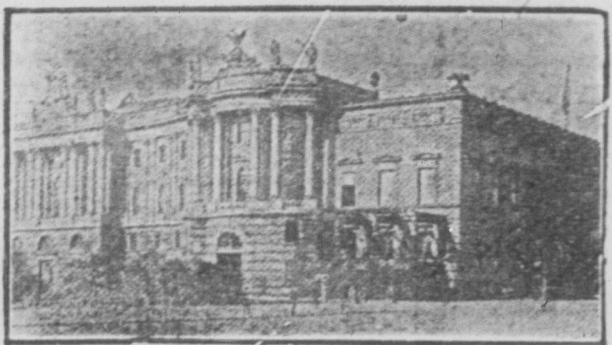
ONE OF THE ROYAL PALACES IN BERLIN.