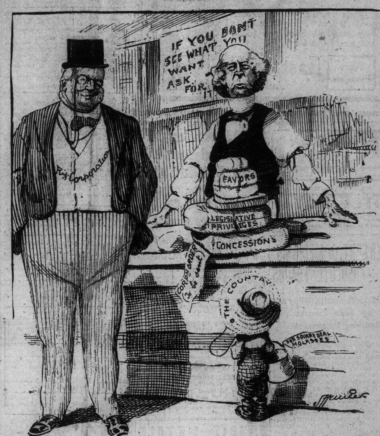
MR. RAILROAD CORPORATIONS (who has been giving a large order): Why, bless me, here's a little man who's been waiting all the while.

an Increase of 4 p.c.—Trade With Britain and U.S.