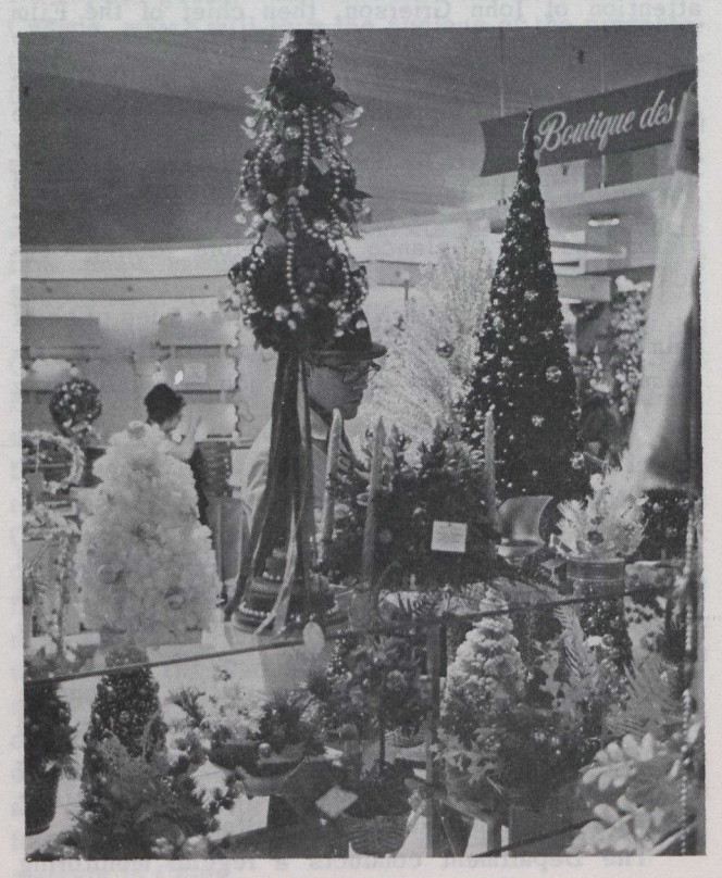
Dressing up for Christmas.

Certain growers in the Eastern Townships are already aiming at an annual production of 10,000 to 20,000 Christmas trees. In 1970, Quebec exported some 1,300,000 Christmas trees to the United States, more than half of which came from the Eastern Townships.