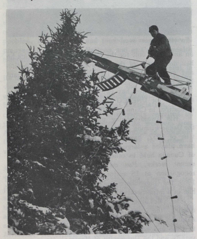
Artificial Christmas trees are growing in demand but Quebec farmers are still doing good business from the sale of natural ones.

Despite strong competition from artificial Christmas trees, the growing of real ones is gaining ground in Quebec, where a number of farmers in the Eastern Townships have gone so far as to abandon all other crops in favour of the Christmas tree. Their fields are gradually being transformed into evergreen plantations, with good yield prospects. Since Quebec alone cannot provide a market for the entire crop, growers must turn to the United States, where, although the sale of genuine Christmas shows a tendency to decline, owing to the sale of artificial trees, there is still enough demand for natural ones of top quality to ensure producers a good income.