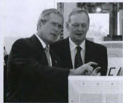
Prime Minister Jean Chrétien (right) and U.S. President George W. Bush on the Ambassador Bridge demonstrating the technology that makes the FAST program possible.