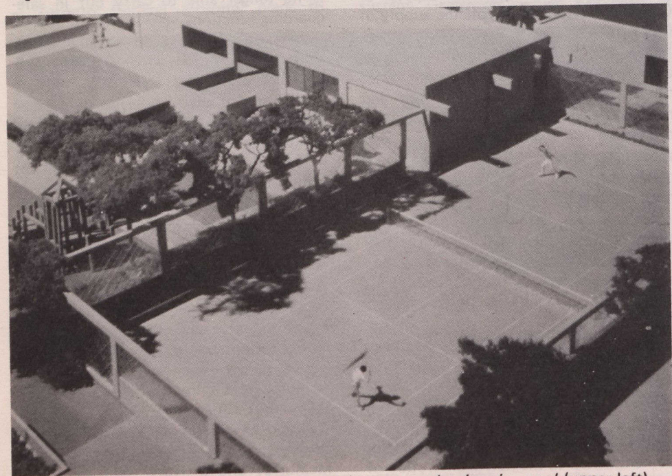
A view of recreation facilities including tennis courts and swimming pool (upper left).

Windows, door knobs, plumbing fixtures, locks and hinges will be imported