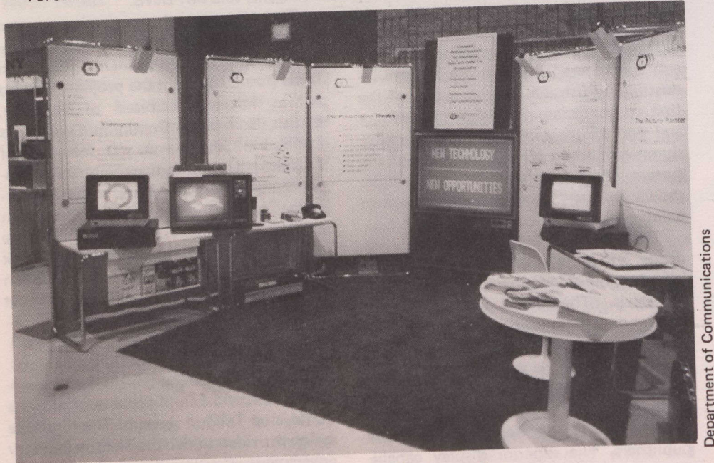
Booths set-up by Videopress provide shoppers with information.

The federal government has also announced that the Manitoba Telephone System (MTS) will be given almost $1 million to extend its Grassroots project and to develop a telecommunications monitoring system. Grassroots, which has been in