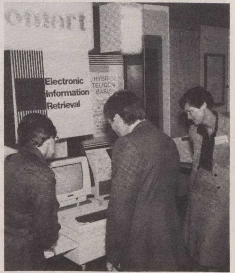
Visitors view Telidon system being used in Manitoba as part of the Manitoba Telephone System's "Grassroots" project.

Information providers for the Sydney demonstration included leading airlines, travel agents, resort operators and travel publishers. The superior display capability of the Videonet system offers a