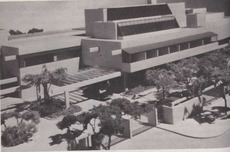
Model shows the front of Canada's new embassy in China.

A delegation of Chinese architects and engineers visited Canada to familiarize