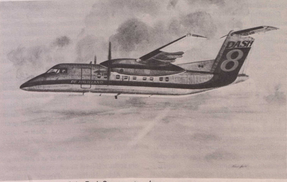
An artist's concept of the Dash 8 commuter plane.