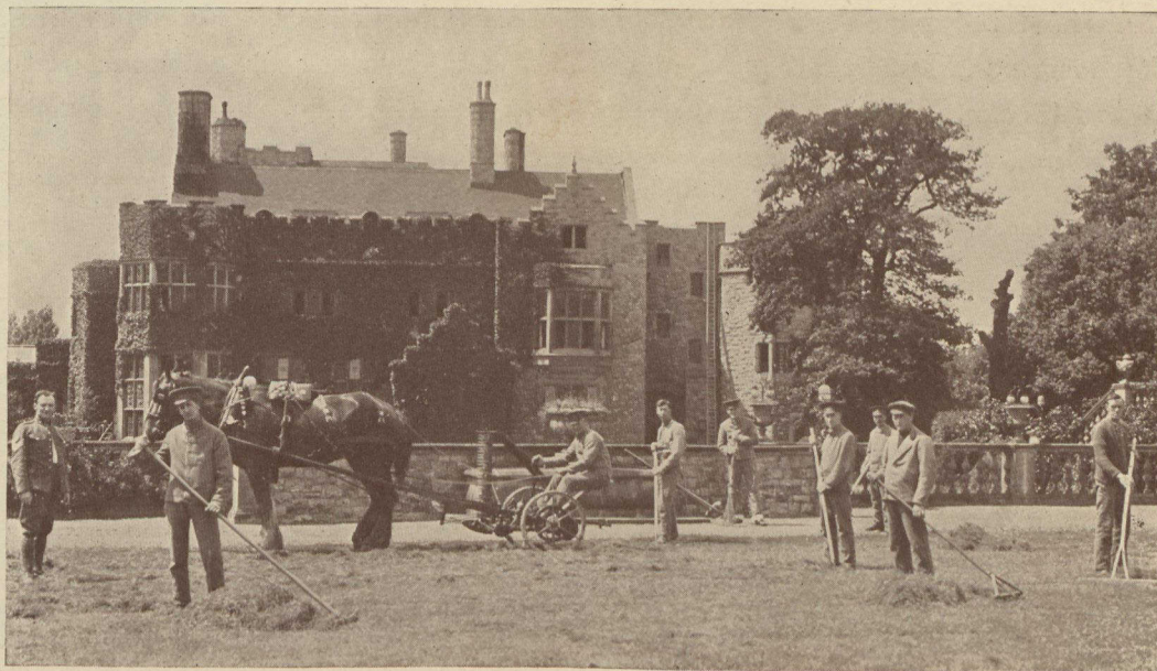
The Convalescents at work preparing the ground for the Opening.