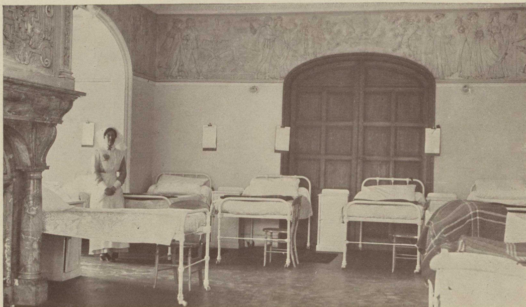
One of the Wards.