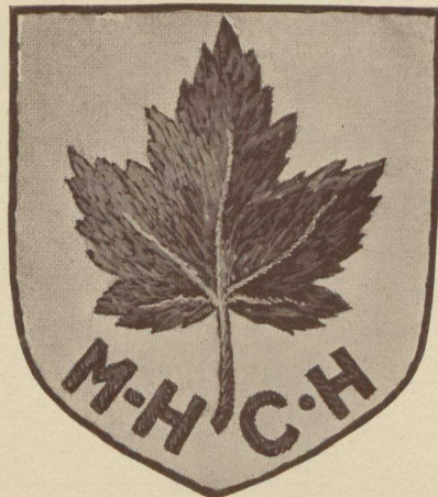
The Badge of the Home.

We would be glad to receive donations of any of the above articles from our shareholders, subscribers or others. The Home will, no doubt, have an average of 90 to 100 inmates continually, and large quantities of these requisites and comforts will be required. Address to Massey-Harris Co., Ltd., Toronto, and mark on outside of package "For Convalescent Home."