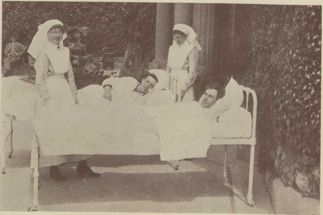
On the Terrace.