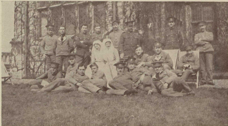
A few of the first soldiers to enjoy the comforts of the Home.

at the front. So when it became known that the Massey-Harris Home was to be operated under Canadian auspices we received a large number of applications for the positions, chiefly from those who had heard the call for service and were desirous of using their ability and experience for the alleviation of the sick and wounded. From the long list of applicants we selected four who were highly recommended for the positions and met all the conditions. They are all Canadians, and each is a graduate of a first-class, reputable hospital, with considerable and varied experience in general nursing. Many reports received since the Home commenced operations assure us that we have made no mistake in our selection, and that every one of the nurses is working loyally and whole-heartedly to carry out the best objects of the Home.