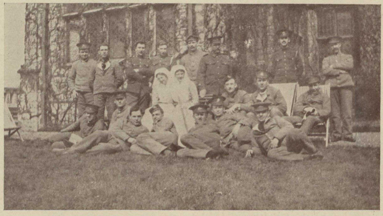
A few of the first soldiers to enjoy the comforts of the Home.

at the front. So when it became known that the Massey-Harris Home was to be operated under Canadian auspices we received a large number of applications for the positions, chiefly from those who had heard the call for service and were desirous of using their ability and experience for the alleviation of the sick and wounded. From the long list of applicants we selected four who were highly recommended for the positions and met all the conditions. They are all Canadians, and each is a graduate of a first-class, reputable hospital, with considerable and varied experience in general nursing. Many reports received since the Home commenced operations assure us that we have made no mistake in our selection, and that every one of the nurses is working loyally and whole-heartedly to carry out the best objects of the Home.