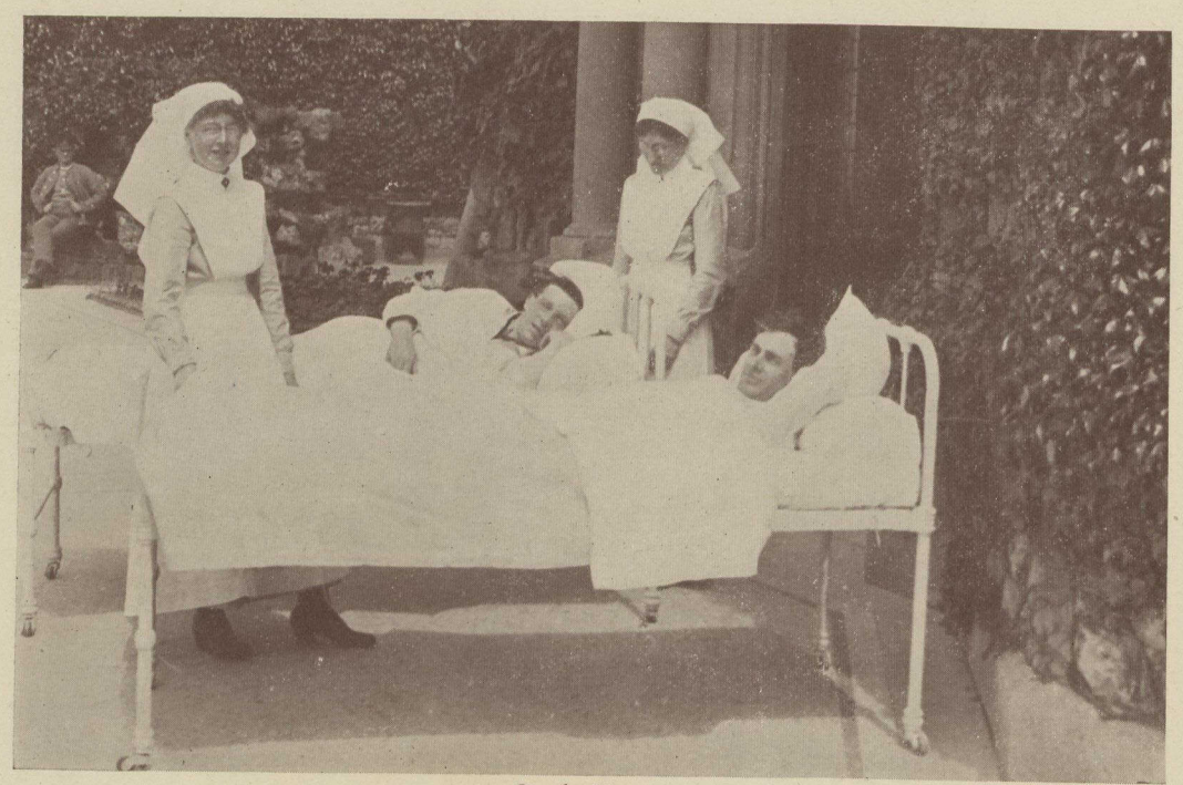
On the Terrace.