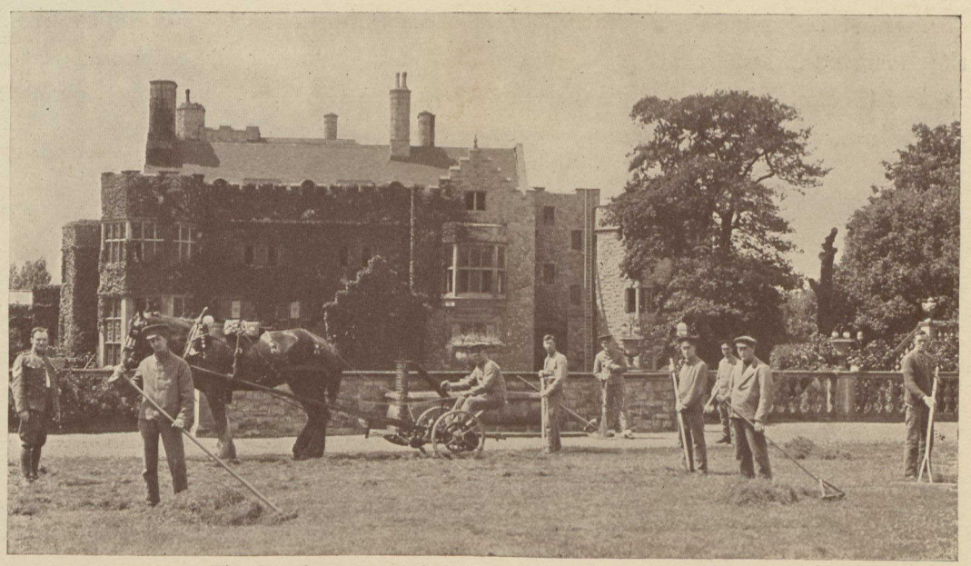
The Convalescents at work preparing the ground for the Opening.

Reveille - 5.30 a.m. Roll Call - 2.00 p.m. Breakfast - 7.00 " Supper - 5.00 " Roll Call - 8.00 " Retreat - 6.30 " Sick Call - 9.00 " Roll Call - 9.00 " Roll Call - 9.00 " Lights Out 9.45 "