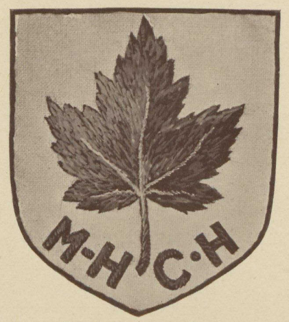
The Badge of the Home.

We would be glad to receive donations of any of the above articles from our shareholders, subscribers or others. The Home will, no doubt, have an average of 90 to 100 inmates continually, and large quantities of these requisites and comforts will be required. Address to Massey-Harris Co., Ltd., Toronto, and mark on outside of package "For Convalescent Home."