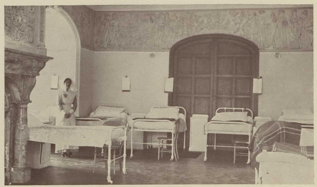
One of the Wards.