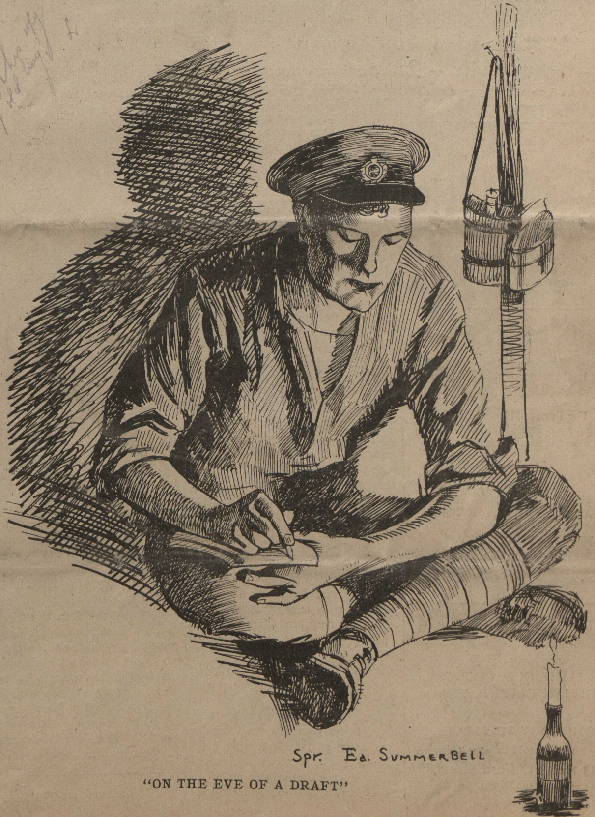
"ON THE EVE OF A DRAFT"

And this was what in a great measure did take place. There was warfare of movement. But in one respect, a very important respect, the old fashioned warfare of the open was not reproduced anew. The present war, at least in Europe, is what no other war ever was so much—a war of "materiel". In the first place the heavy guns are a dominant element. These can