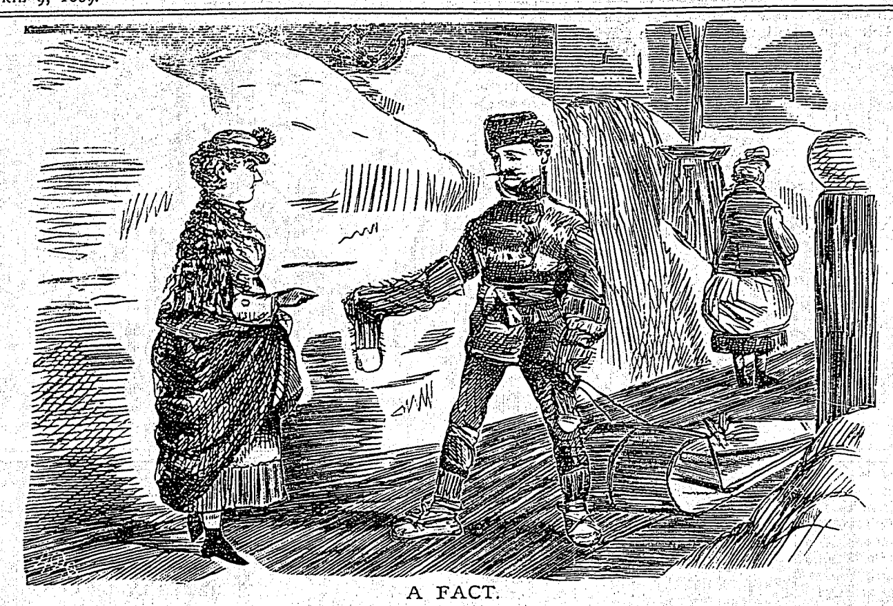
DE BOLSTER RETURNS FROM TOBOGANNING IN RATHER EXTEMPORANEOUS GARB, AND MEETS ONE OF THOSE PRETTY GIRLS GOING TO THE RINK: DEB. —(log.) "How do? Excuse my glove!"