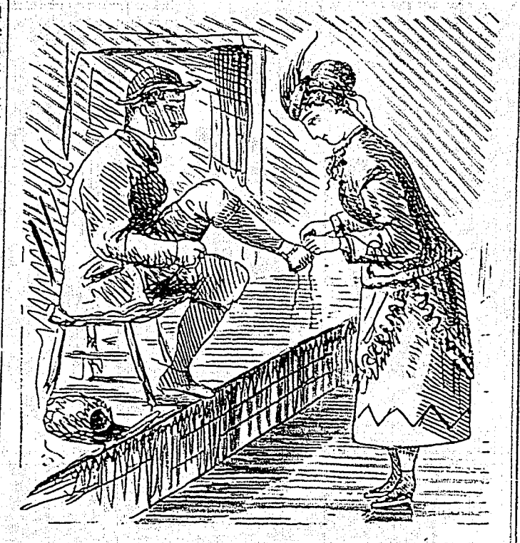
A TRUE LOVER'S KNOT.