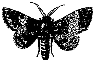
DYARIA SINGULARIS ,

Head prominent, with a high vertical tuft. Front nearly square, rather higher than broad; slightly convex. Vertex small, with a low, conical central projection. Ocelli absent. Eyes large, naked, reaching as far as the front and above the vertex. Antennæ inserted far apart, close to the margin of the eyes. In ♂ lengthily bipectinate, the pectinations diminishing gradually, the distal third being bare. To judge from the fragments of a ♀ specimen with broken off antennæ (only 6 joints left to judge from), the ♀ antennæ are apparently simple. Palpi exceeding front by two-thirds their length; second joint very large, third small. Tongue weak, but moderately long, coiled. Thorax robust, about as broad as long.