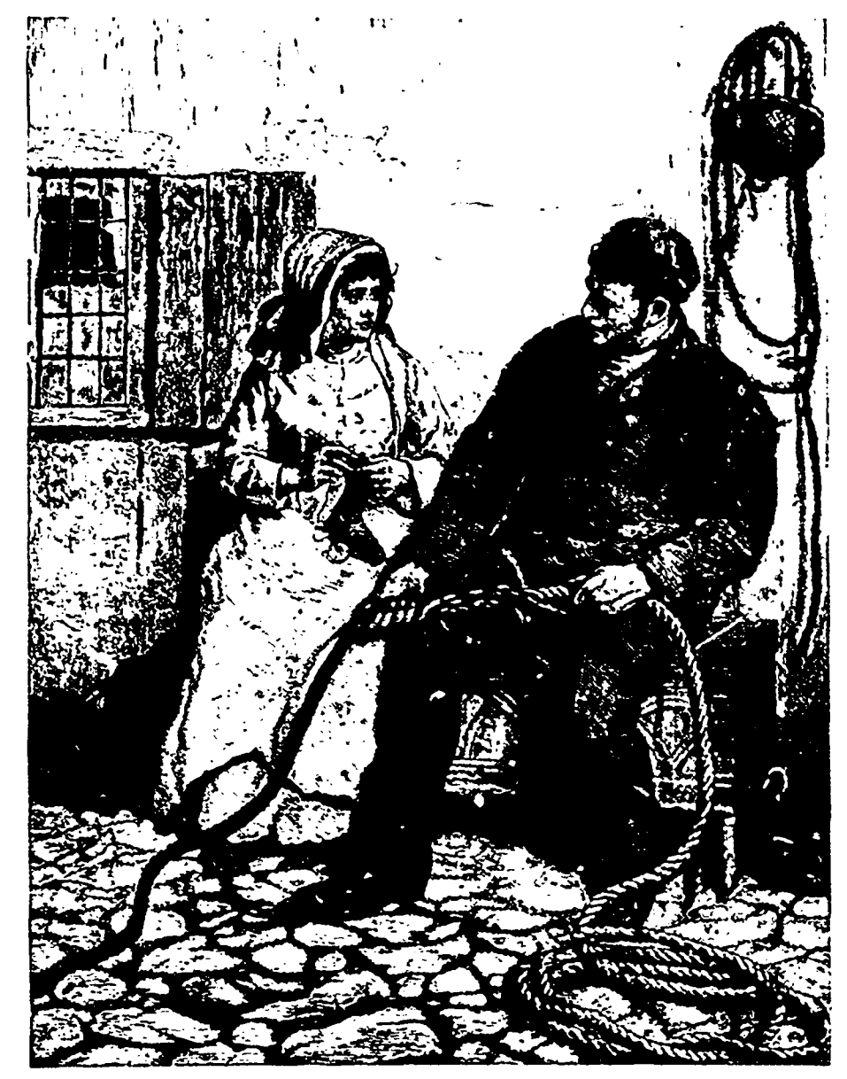
SPINNING A YARN.

her mother what she had done in the knows how to repent of her sin and show