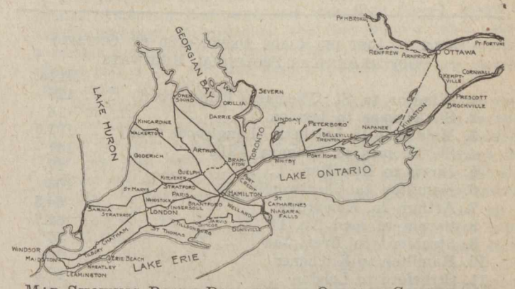
MAP SHOWING ROADS DESIGNED BY ONTARIO GOVERNMENT AS PROVINCIAL HIGHWAYS

Where the Ontario Good Roads Act is in force, the mileage of township roads is established. We are not opening up a lot of new roads. If the county can relieve the township of