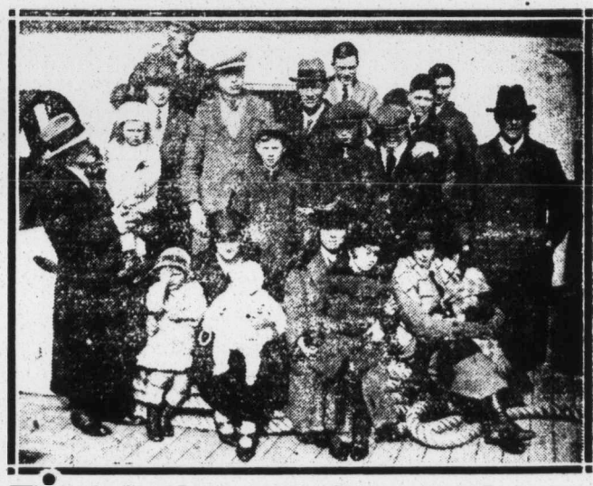
The first families of British settlers for Canada under the Empire Settlement Scheme disembarked from the Cunard liner Antonia at Halifax last Saturday (March 21).