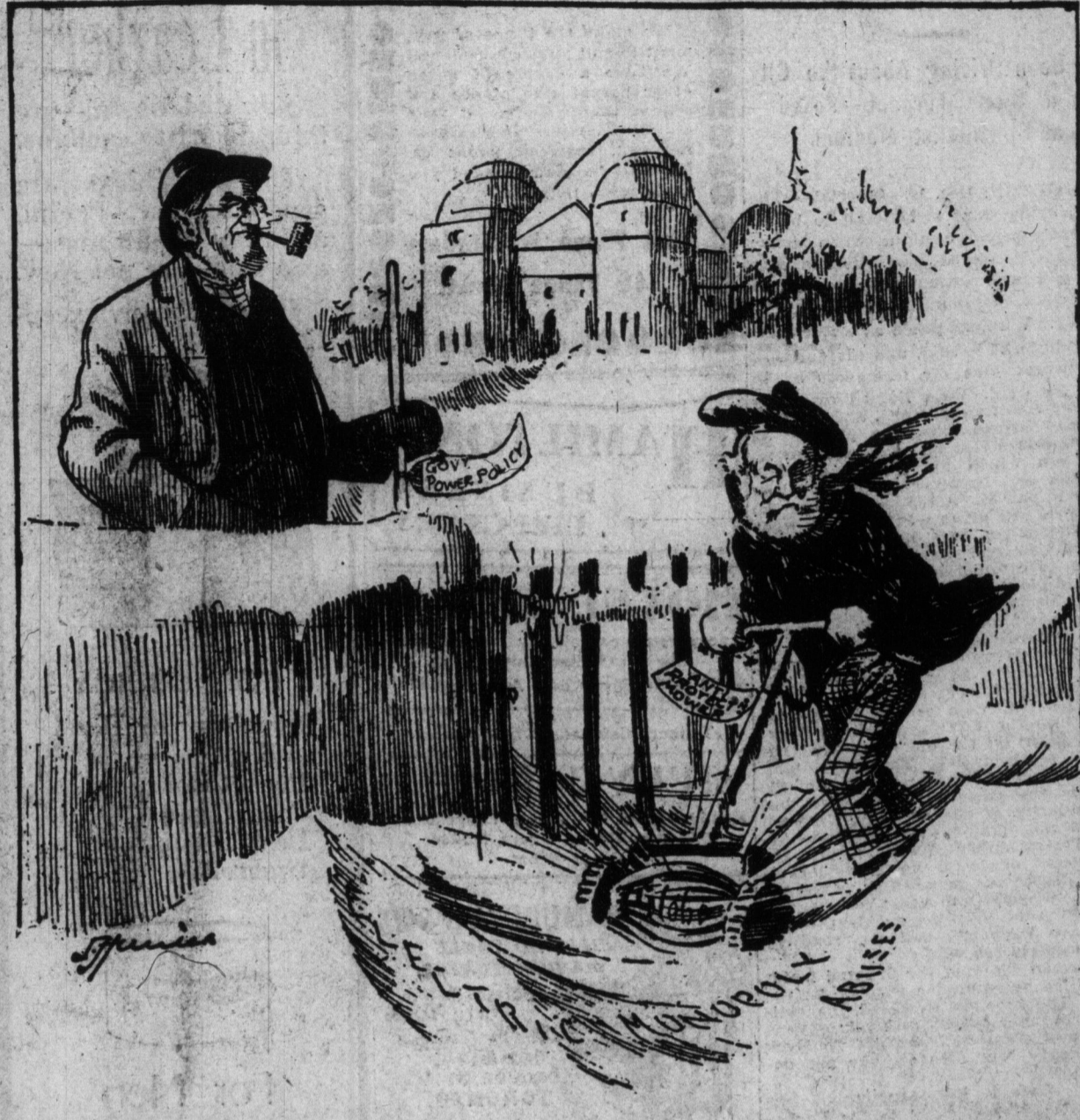
OLD MAN ONTARIO: You may be looking for work, but I notice you generally come round with a lawn mower when snow shovels are trump.