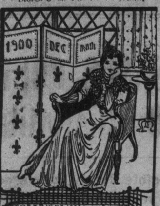
Stores Open Till 10 P.M.

Does his style of dress worry you? Simply have the newspaper in your hand when he calls next time, tell him you always notice our ad. and ask him what kind of clothing he will.