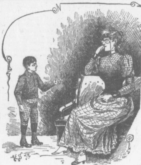
A DOUBTING THOMAS.

TEACHER—With the exception of the animals Noah took with him into the Ark, every living creature perished in the flood.