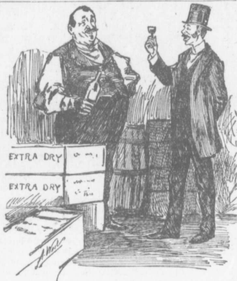
THE LAWYER "TRIES A CASE."