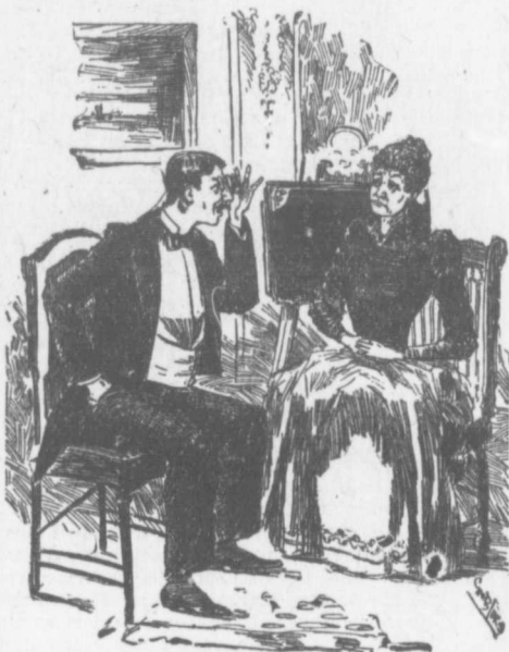
ADDING INSULT TO INJURY.

While conversing with Miss Esmerelda Longcoffin, an old maid of Houston, Texas, she asked a young man in a bantering tone: