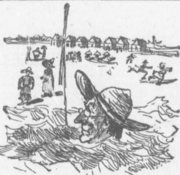
THE PASTOR ENJOYING A REST.