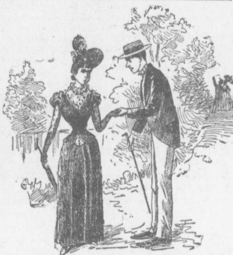
OVERHEARD IN CENTRAL PARK.

HE—Don't go yet. SHE—I must. It is past ten o'clock. "You needn't be in a hurry." "O, I must go. I have no key, and my father will be very angry." "I suppose your father is a cruel despot." "No, he is only janitor of the flat."