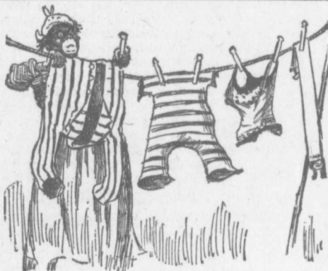
AN OLD, OLD TITLE FOR A PAINTING—"THE CLOSE OF A SUMMER'S DAY."