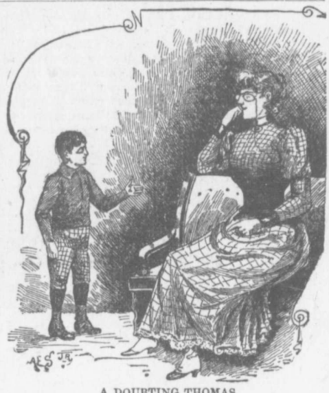
A DOUBTING THOMAS.

TEACHER-With the exception of the animals Noah took with him into the Ark, every living creature perished in the