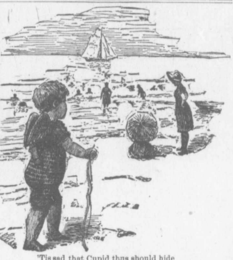
'Tis sad that Cupid thus should hide His grace of form and limb; But he must don a bathing suit If he'd be in the swim.