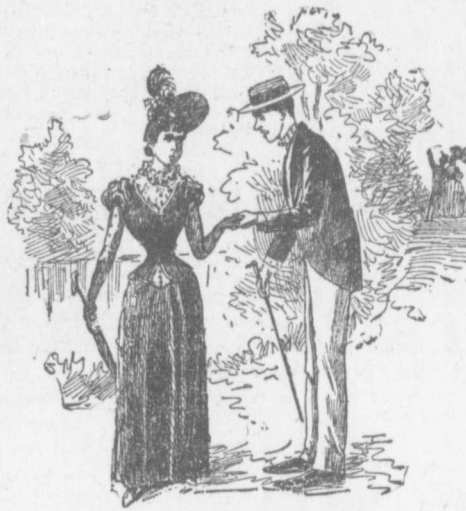
OVERHEARD IN CENTRAL PARK.

HE—Don't go yet. SHE—I must. It is past ten o'clock. "You needn't be in a hurry." "O, I must go. I have no key, and my father will be very