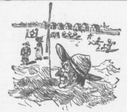
THE PASTOR ENJOYING A REST.