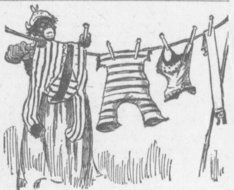
AN OLD, OLD TITLE FOR A PAINTING-"THE CLOSE OF A SUMMER'S DAY." —Texas Siftings.