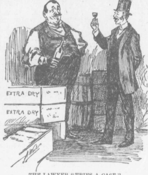
THE LAWYER "TRIES A CASE." — Texas Siftings.