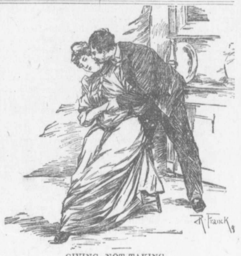
GIVING, NOT TAKING.

SHE—Oh, you are going to rob me of a kiss. COUSIN—Rob you? Never; I am going to give you one.— Texas Siftings.