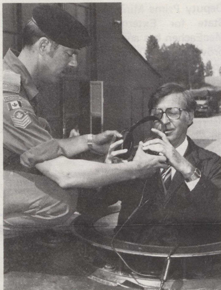
Defence Minister Lamontagne (right) during a visit of Canadian Forces in Europe.