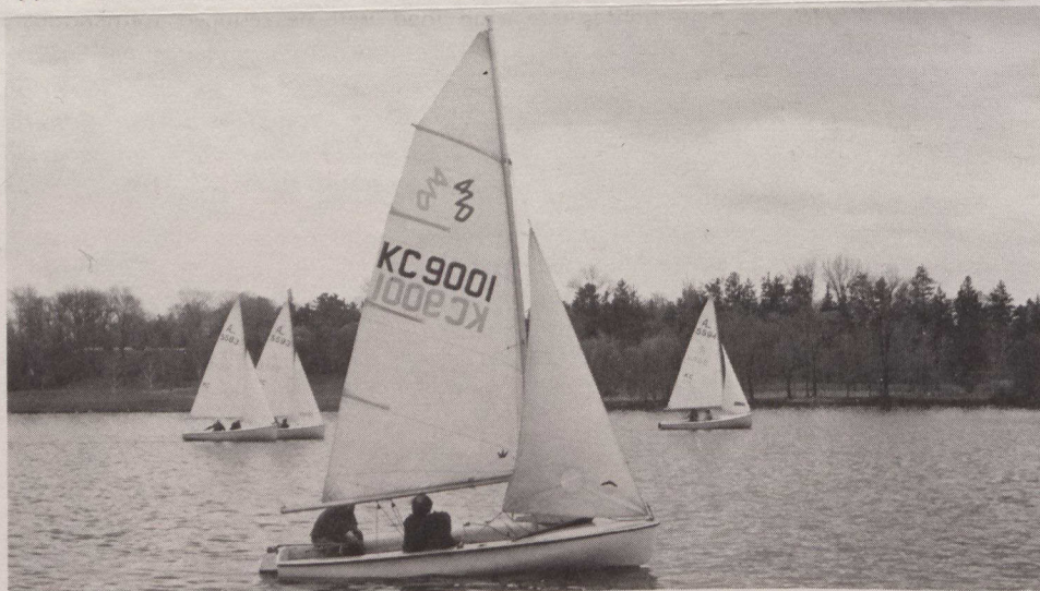
The Canadian Hydrographic Service provides charts for recreational boaters.