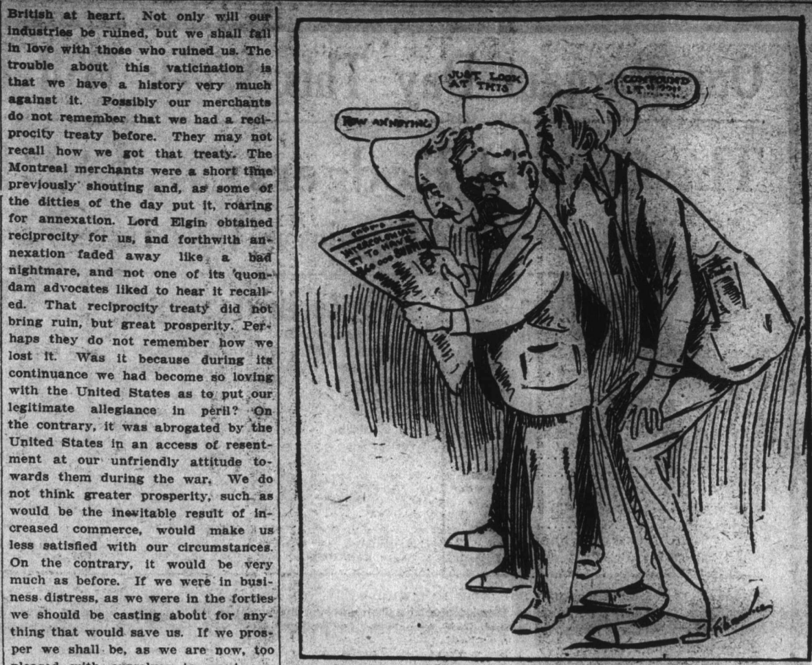
ANOTHER SEVERE BLOW FOR THE GRAND OLD CONSERVATIVE PARTY

When the high tariff men find that they are threatened by a general decrease in duty, the ancient loyalty cry is always brought into play, as a never failing helper in time of need.