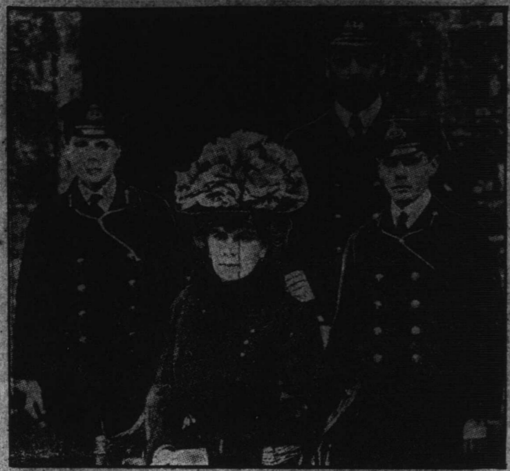
THE NEW KING AND QUEEN AND THEIR ELDEST SONS, EDWARD AND HAROLD