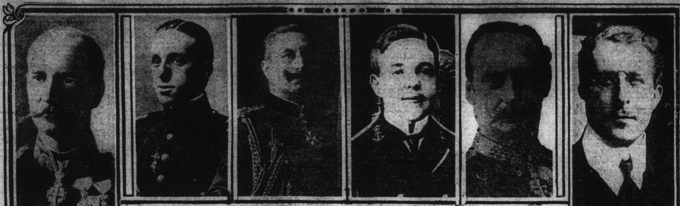
SIX EUROPEAN MONARCHS IN ENGLAND TO ATTEND THE FUNERAL OF THE LATE KING

London, May 19.—Sir Charles Fitzpatrick says of the coronation oath: "I will content myself with saying just this. No man that has the cause of imperialism really at heart, no man who dreams of drawing closer ties binding the scattered units of the empire can wish to have King George at the beginning of his reign repeat the words of royal declaration."