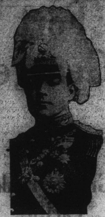
MANUEL—KING OF PORTUGAL

for the government. In Warsaw the police have made 300 visits to the houses of the officials, traced officials, army contractors, gamblers and mistresses of suspects. The banks are also being compelled to make statements of the private accounts of the officials. The investigators estimate that in St. Petersburg alone $19,000,000 has been stolen. Liberal members of the Duma are trying to force a similar investigation of the navy department, compared with which the army supply department is described as a "school of honesty." Davis' Menthol Salve is a handy pleasant and efficacious household remedy for insect and mosquito bites and stings, skin diseases, piles, etc. Try it. 25c. per tin.