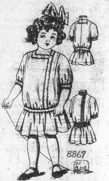
8869. A New Frock for Mother's Girl. Girls' One-Piece Dress With Body and Skirt in One.

The Home Dressmaker should keep a Catalogue Scrap Book of our Pattern Cuts. These will be found very useful to refer to from time to time.