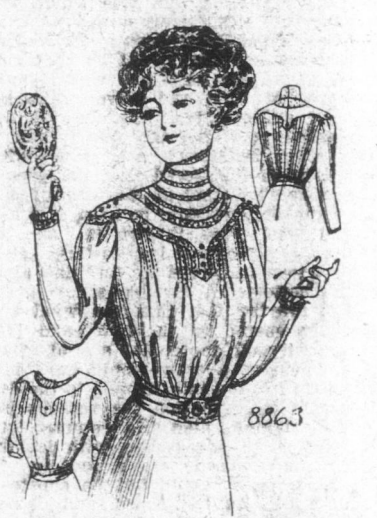
8863. Lady's Waist, WITH OR WITHOUT YOKE AND YOKE TRIMMING.