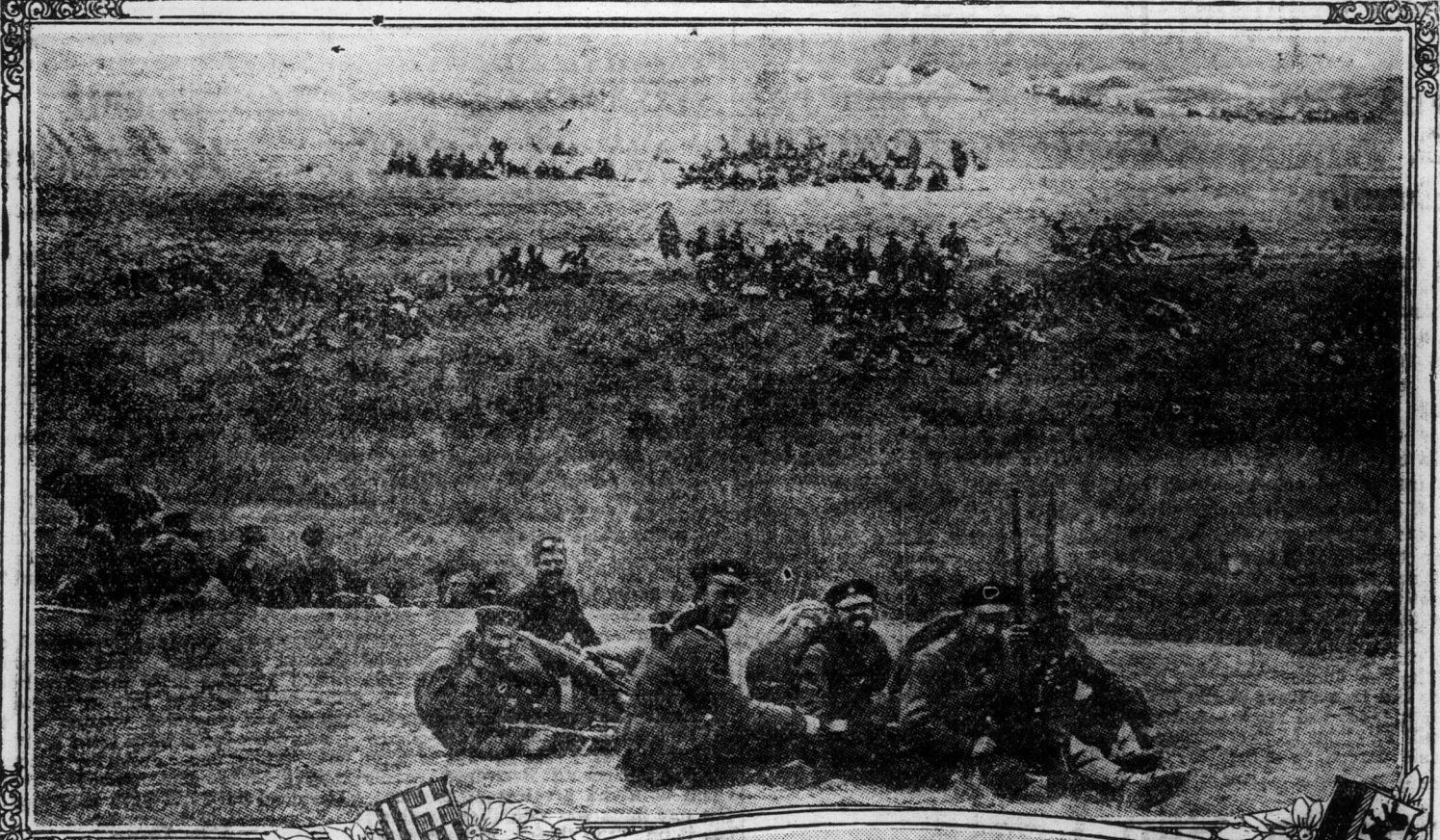
AN ADVANCED POST OF THE BULGARIAN ARMY

The invasion of Greece by a strong force of Bulgarian troops has aroused the former country into a high pitch and has added another phase to the big European conflict. The Greeks made little resistance to ward off the invasion of a hereditary foe. This action was due to the fact that the Athens government decided that resistance would have drawn Greece into war and the government has determined to remain neutral. Not all the Greek government leaders give easy compliance to the invasion, and the new Cabinet will protest at once. The Athens Herald appears with a black border, and Mr. Venizelos, one-time Premier, writes in that journal: "Whoever dreamed to see the Bulgarian flag supplant the Greek flag in Macedonia? Just for this we have sustained mobilization at the cost of the economic aim of the country."