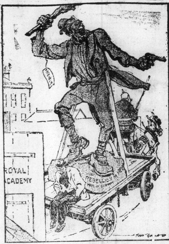
REJECTED.—London Opinion, London, England.

READY FOR INVASION. "An invasion of India from the northwest is no easy matter. We have been expecting such for over a century and have been preparing for it. We have strategic railways up the frontier at many points, and strategic railways along it. The most vulnerable points are strongly defended. The British regiments which were sent from India to fight at Ypres have been replaced. India was never so strong in artillery as at the present moment. If there was ever a time when such an enterprise could have been at-