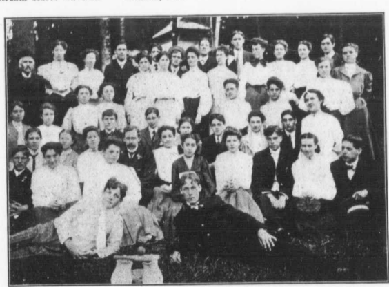
AN EPWORTH LEAGUE PICNIC

The annual summer outing of the Euclid Ave. League, Toronto. This League keeps up its services all the year without interruption. On one evening in July there was an attendance of seventy, twenty-four of whom were young men. Count the young men in this picture