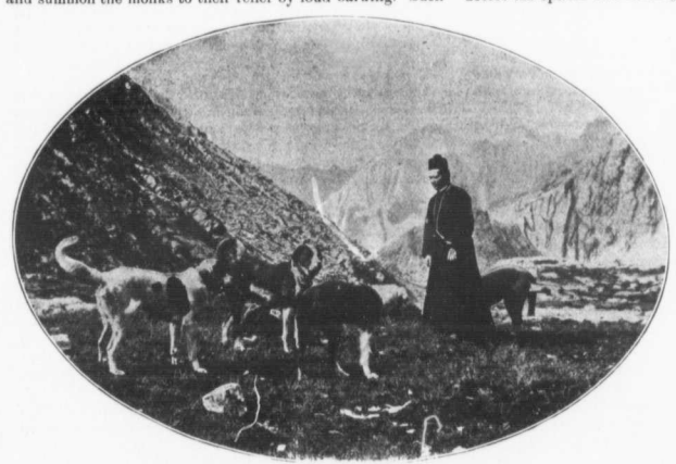
THE REAL ST. BERNARD DOGS

The popular idea of the St. Bernard dogs and their work, as gained from old books of travel, is that they wander about on the mountains, alone or in couples, searching for lost travellers and bearing cordials and wraps with which to relieve them; that they scrape away the snow from those who are almost buried, restore them to consciousness by licking the hands and faces and warming them with their bodies, and summon the monks to their relief by loud barking. Such