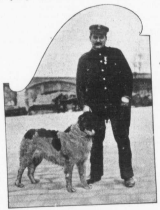
A LIFE-SAVING DOG IN PARIS

Of course, the "higher critics," who will never let us enjoy a good story in peace, tell us that the whole thing is a myth,