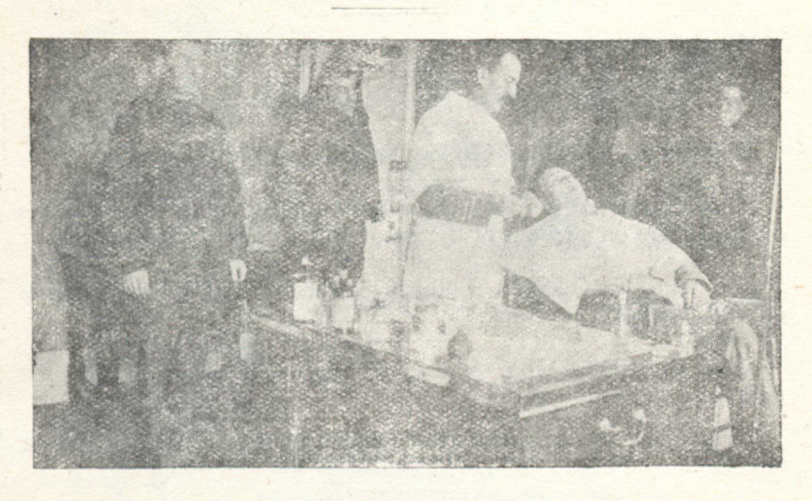
ARTISTIC OFFICIAL PHOTOGRAPH AND---