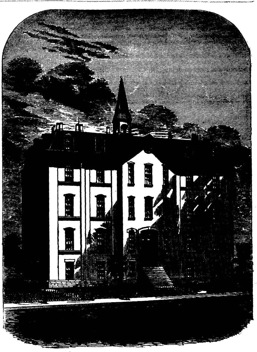
DESIGN FOR A FOUR STORY SCHOOL HOUSE.