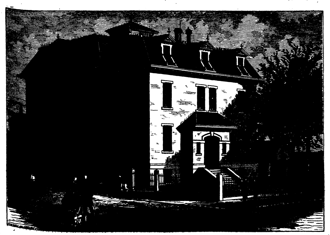
THE CAPEN PRIMARY SCHOOL-HOUSE, BOSTON.

The principal item is the grant of $220,000 for the Public and Separate Schools. This is an advance on last year's grant of $20,000. The sum proposed by the Chief Superintendent was $210,000, with an earnest request to the Government to increase the amount to $250,000. A medium sum was, however, agreed to by the Government, and the grant was fixed at $220,000. And, as explained to the House by the Hon. the Provincial Treasurer, the "$250,000 urged by the Chief Superintendent would be in some proportion to the increase of pupils, the increased wealth and revenue of the country, the demands of