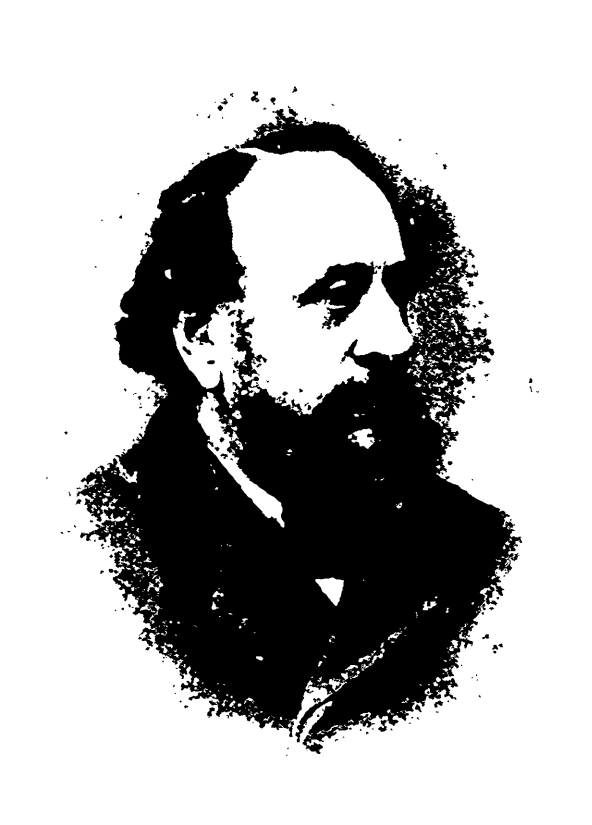
SIR EDWIN SAUNDERS