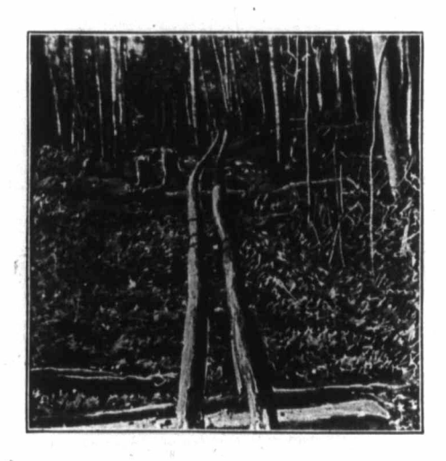
Tramway from No. 1 shaft to dock, length 340 feet.

Every blast in our shafts produces ore bearing visible Gold. As depth has been attained our veins have steadily widened, and the ore has increased wonderfully in richness. Prof. McKaig, of the Princeton University, made two assays last April of samples of our ore, with the average result of $2,354.17 per ton Gold and $5.00 per ton silver.