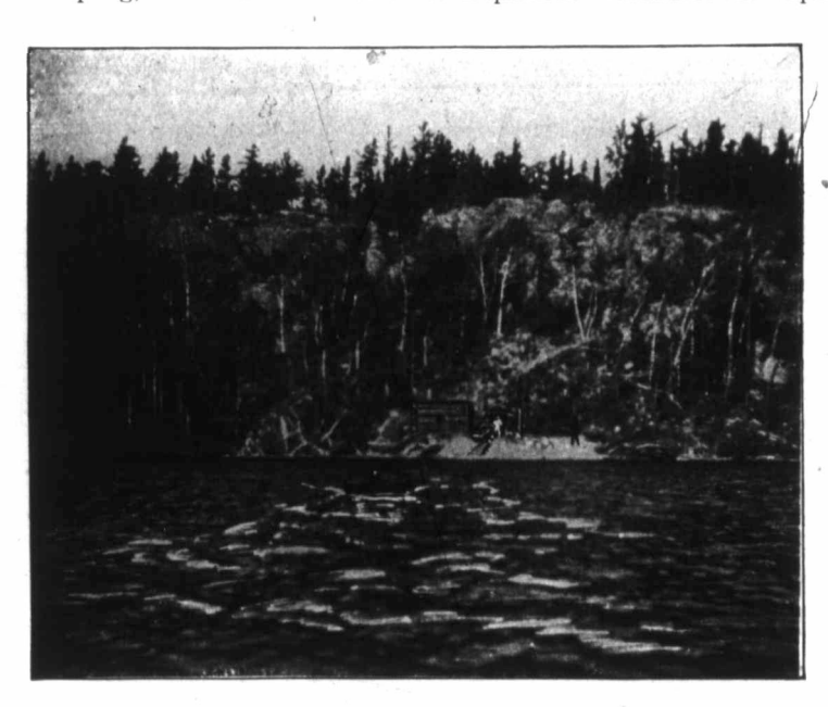
Tunnel Hill, showing Tunnel from a distance. One hundred and fifty-eight feet of work done in this Tunnel, March, 1903.

tersection of a series of quartz "feeders" little work has yet been done on these well defined veins. The shots, and other work referred to, however exposed some very rich fragments of gold quartz, assays of which run from $73 to $82.50 per ton. These samples were from a quartz ledge near the apex of "Tunnel Hill," at or near the supposed junction of No. 3 and No. 1 veins. No. 5 vein is south of 3 and pans gold, but as neither Nos. 4, 5 or 6 veins have any appreciable quantity of work done upon them, beyond "stripping" and sampling, we must await further developments. Meantime the import-