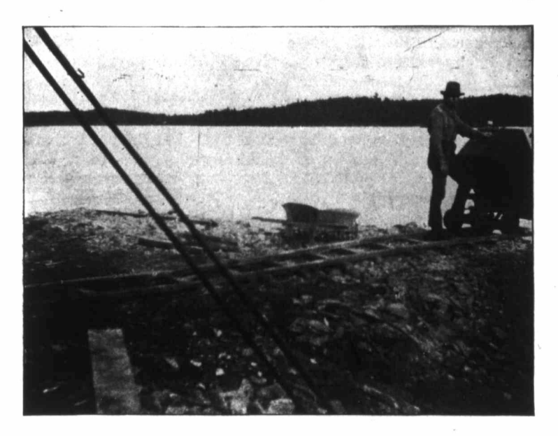
Miner dumping waste rock into Grace Bay from Tunnel.

Certain prospecting work has been done on the property by sinking a Pit, known as "Pit Number Two," and the values obtained by milling 13½ tons of ore from this place indicate that a pay chute outcrops here. The ore body, so far as exposed, at this point, presents the appearance of a "stock-work" in a shear zone in the country rock, and is about seventeen feet wide on the surface. I think it will be found, however, that much higher values are contained in the portion of the vein, about a foot wide, on the strike of (and possible continuation of), the vein at Number One Pit, than in the other portions of the vein, which branches out here in numerous stringers. It is a matter of very great