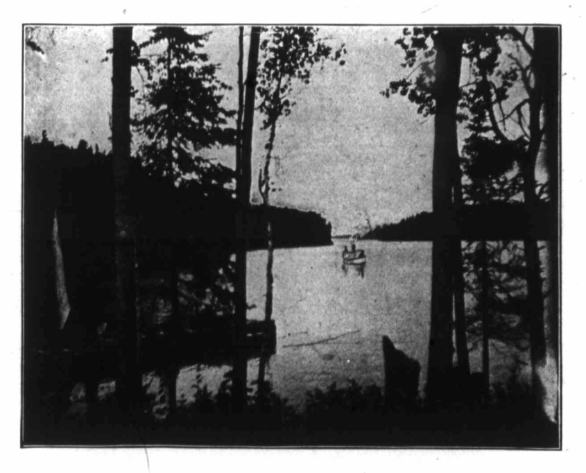
This beautiful view taken near the office upon Grace Mine, looking Northeast. Company's Steamer in the distance.

The properties of the Grace Mining Company are about 1300 miles northwest of Buffalo, N. Y., and 245 miles west of Port Arthur, the head of navigation