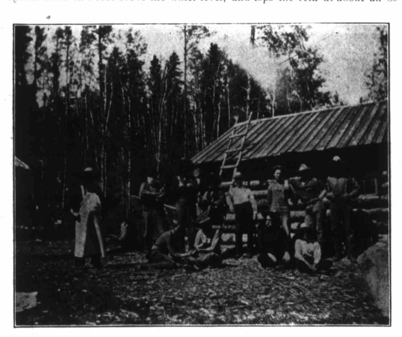
Miners and south side of the Company's office building. About 20 feet to the rear and right of our Chef is the Miners Camp.

No. 3 vein is situated on a bluff about 80 to 90 feet above the water level, runs at nearly right angles from Nos. 1 and 2 veins. No. 3 vein is stripped and uncovered for over 500 feet. It enters the water at one end and drops into low ground at the other. The distance southwesterly from where No. 3 vein enters the water on the front side of our property to the tunnel is 462 feet. The tunnel starts in 6 feet above the water level, and taps the vein at about an 80