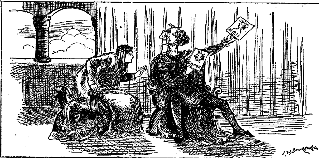
"LOOK HERE, UPON THIS PICTURE, AND ON THIS!"