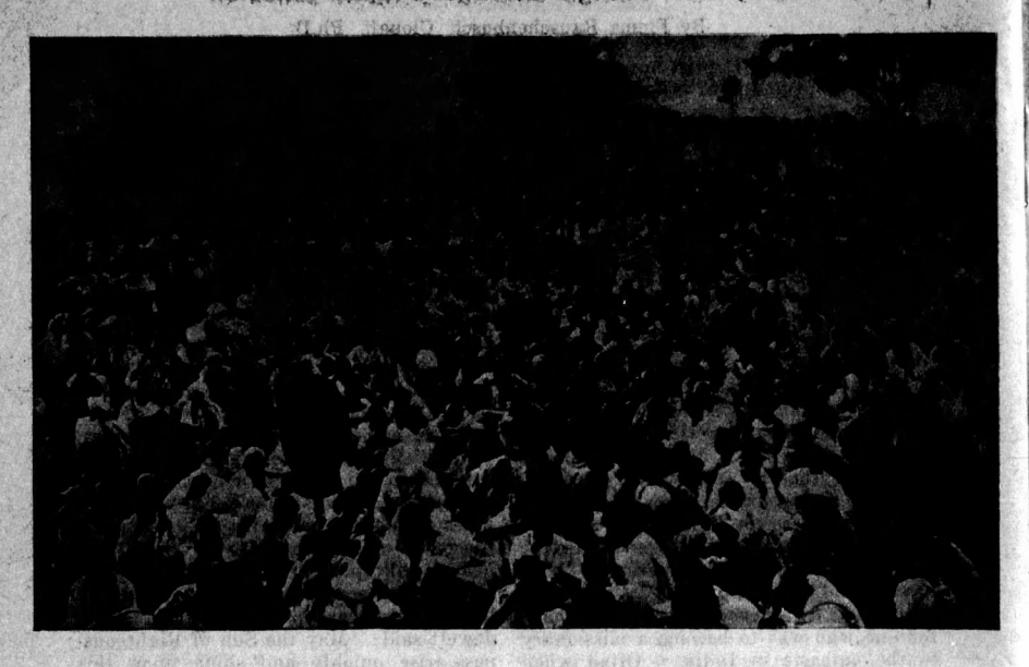
A MEETING ON THE FAMOUS PRAYER-MEETING HILL

he was sworn in as United States Deputy Surveyor, and, with fifteen men under him, worked on contracts for the government. It was valuable training. time came, twenty years later, out in India, when his knowledge of engineering brought help to thousands in time of famine.