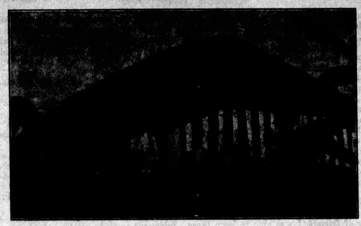
A typical Pastor-Teacher's home. He is stationed in a little out-village, where he shepherds the Christians, who may live in the vicinity, cares for the Sunday services, and, either he or his wife teaches the day school of boys and girls who gather on the verandah at the front of the house. The life and influence of such a Christian family is as "a city set on a hill which cannot be hid."

best out of life, but to try to give the most to make others happy. Before, my own aim in life used to be, how much money I could make and how much fame I could win for myself. Now it is the reverse. What is the use of all this worldly wealth and fame if we do not receive God's commendation? If I can earn enough for my daily bread and be able to help suffering and needy beings around me, it is sufficient."