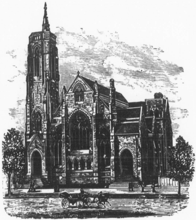
ST. JAMES SQUARE PRESBYTERIAN CHURCH.