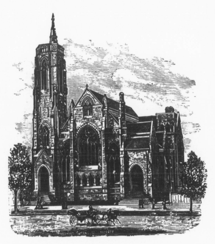
ST. JAMES SQUARE PRESBYTERIAN CHURCH.