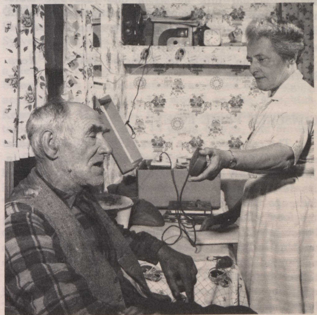
A native Nova Scotian records another item for Helen Creighton's collection of folklore.

The offshore islands, of which there are hundreds strewn along the Nova Scotia coast, were always tricky. Huddled in an open boat, thrashed and drenched by the salty tail of a hurricane, has been all part of a day's work for the Lady of the Legends. And once ashore, chances were she'd have to push her recording machine along the stony footpaths in a wheelbarrow.