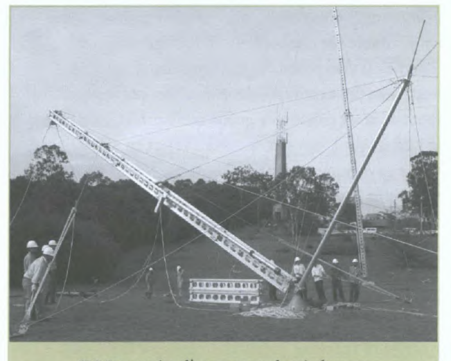
SBB International's emergency electrical towers

SBB International has revolutionized the market for emergency electrical towers. The company has spent 10 years and over $1.5 million developing this fast-mounting tower for the transmission of electricity. In Brazil, the company has sold more than 85 emergency towers valued at more than $6 million. Its towers each provide up to 500 kilovolts of power, are composed of modular aluminum components and can be erected in just three hours.