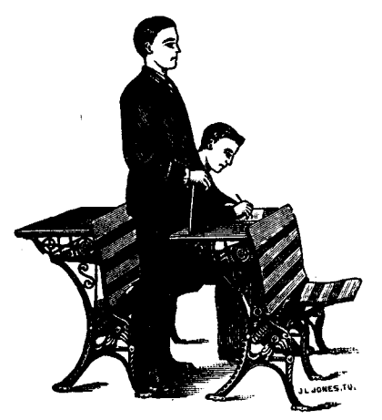
THE "PERFECT AUTOMATIC" SCHOOL DESK. The latest and best.

Manufacturers or Office, School, Church and Lodge Furniture.